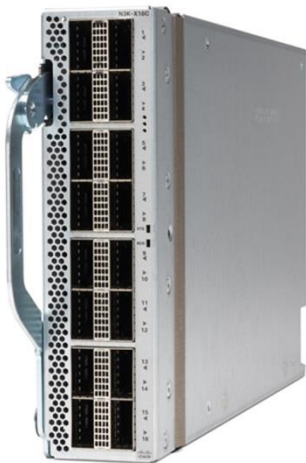
Figure 2 Cisco Nexus NXM-X16C, 16 ports of 100G

The 100G LEMs are 16 ports of QSFP28 supporting 100, 50, 40, 25, and 10G speeds.