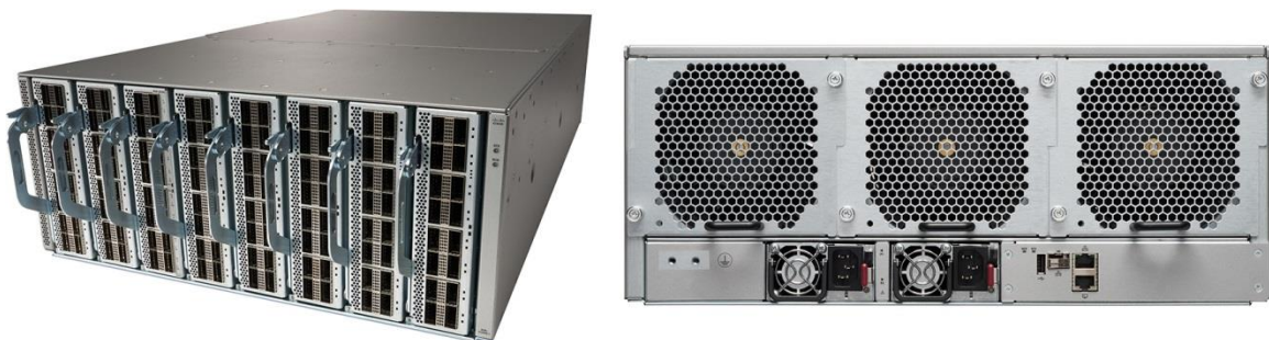
Figure 1. Cisco Nexus 3408-S

The Cisco Nexus 3408-S (Figure 1) is a 4-Rack-Unit (RU), 8-slot chassis with the flexibility of 100G or 400G Line-Card Expansion Modules (LEMs) offering 128 ports of 100G or 32 ports of 400G. The Cisco Nexus 3408-S is the industry's highest port radix in a compact and energy-efficient form factor. The Cisco Nexus 3408-S supports HVAC/DC power inputs with forward airflow direction.