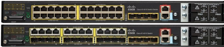
Table 2. Cisco IE 4010 Series switch models