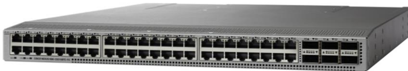
Figure 5. Cisco Nexus 93108TC-FX Switch

The Cisco Nexus 9348GC-FXP Switch (Figure 6) is a 1RU switch that supports 696 Gbps of bandwidth and over 250 mpps. The 48 1GBASE-T downlink ports on the 9348GC-FXP can be configured to work as 100-Mbps, 1-Gbps ports. The 4 ports of SFP28 can be configured as 1/10/25-Gbps and the 2 ports of QSFP28 can be configured as 40- and 100-Gbps ports. The Cisco Nexus 9348GC-FXP is ideal for big data customers that require a Gigabit Ethernet ToR switch with local switching.