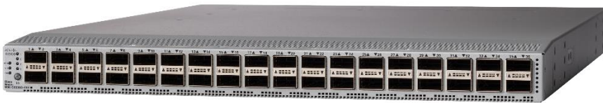
Figure 7. Cisco Nexus 9336C-FX2 Switch

The Cisco Nexus 93240YC-FX2 Switch (Figure 8) supports 4.8 Tbps of bandwidth and over 1.8 bpps. The 48 ports of downlinks support 1/10/25-Gbps. The 12 uplinks ports can be configured as 40- and 100-Gbps ports, offering flexible migration options. Breakout is not supported at FCS, but is on the roadmap. The switch is ideal for a non-oversubscribed solution in a compact form factor. The switch has FC-FEC and RS-FEC enabled for 25Gbps support.