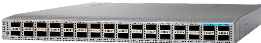
Figure 3. Cisco Nexus 93180LC-EX Switch

The Cisco Nexus 93180LC-EX Switch is the industry's first 50-Gbps-capable 1RU switch that supports 3.6 Tbps of bandwidth and over 2.6 bpps across up to 32 fixed 40- and 50-Gbps QSFP+ ports or up to 18 fixed 100-Gbps ports (Figure 3). The switch can support up to 72 10-Gbps ports using breakout cables. A variety of flexible port configurations are supported using templates.