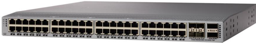
Figure 6. Cisco Nexus 9348GC-FXP Switch

The Cisco Nexus 9336C-FX2 Switch (Figure 7) is a 1RU switch that supports 7.2 Tbps of bandwidth and over 2.8 bpps. The switch can be configured to work as 1/10/25/40/100-Gbps offering flexible options in a compact form factor. All ports support wire-rate MACsec encryption 3 . Breakout is supported on all ports. Please see feature table below for more information.