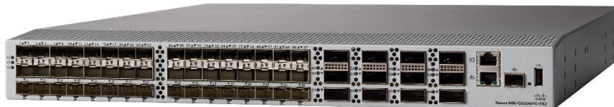
Figure 8. Cisco Nexus 93240YC-FX2 Switch

The Cisco Nexus 93240YC-FX2 Switch (Figure 8) supports 4.8 Tbps of bandwidth and over 1.8 bpps. The 48 ports of downlinks support 1/10/25-Gbps. The 12 uplinks ports can be configured as 40- and 100-Gbps ports, offering flexible migration options. Breakout is not supported at FCS, but is on the roadmap. The switch is ideal for a non-oversubscribed solution in a compact form factor. The switch has FC-FEC and RS-FEC enabled for 25Gbps support.