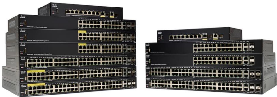
Figure 1. Cisco 250 Series Smart Switches

The Cisco 250 Series is the next generation of affordable smart switches that combine powerful network performance and reliability with a complete suite of the network features you need for a solid business network. These powerful Fast Ethernet or Gigabit Ethernet switches, with Gigabit or 10 Gigabit Ethernet uplinks, provide multiple management options, sophisticated security capabilities, fine-tuned Quality-of-Service (QoS) and Layer 3 static routing features far beyond those of an unmanaged or consumer-grade switch, at a lower cost than for fully managed switches. And with an easy-to-use web user interface, Smart Network Application, and Power over Ethernet Plus (PoE+) capability, you can deploy and configure a complete business network in minutes.