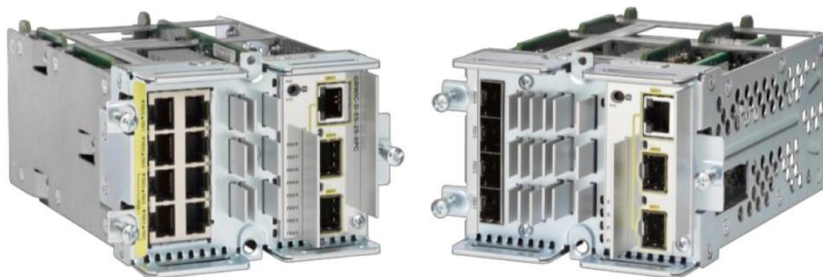
Figure 1. Cisco 2010 Connected Grid Router Ethernet Switch Modules (CGR 2010 ESM)

The Cisco Ethernet Switch Module (CGR 2010 ESM) (Figure 1) greatly expands the Cisco 2010 Connected Grid Router's capabilities by integrating industry-leading Layer 2 and Layer 3 (optional) switching with feature sets comparable to those found in the Cisco 2520 Connected Grid Switches . The new Cisco Ethernet Switch Module along with the Cisco 2010 Connected Grid Router (CGR 2010) are designed specifically for use in connected energy applications such as grid automation, distributed generation, integrated renewable energy, trackside substations, and water, oil, and gas applications. The CGR 2010 ESM uses Cisco IOS® Software, which is the operating system powering millions of Cisco switches worldwide, and provides the benefits of improved security, network resiliency and reliability, and scalability.