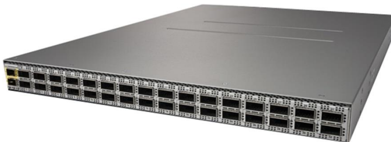
Figure 1. Cisco Nexus 3432D-S Switch

The Cisco Nexus 3432D-S (Figure 1) is a Quad Small Form-Factor Pluggable – Double Density (QSFP-DD) switch with 32 ports that are backward-compatible with QSFP+, QSFP28, and QSFP56. Each QSFP-DD port can operate at 400, 100, 50, 40, and 25 Gbps.