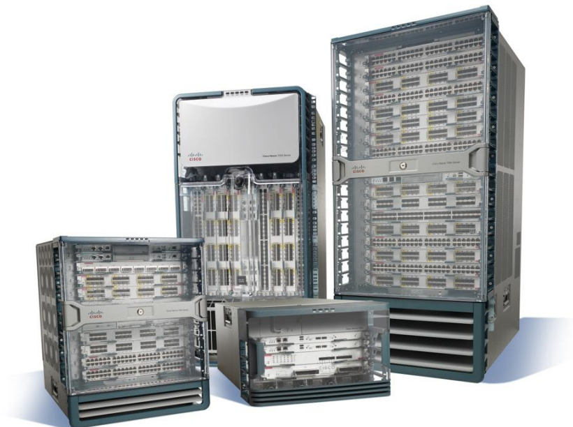
Figure 1. Cisco Nexus 7000 Series

The first in the next generation of switch platforms, the Cisco Nexus 7000 Series (Figure 1) provides integrated resilience combined with features optimized specifically for the data center for availability, reliability, scalability, and ease of management.